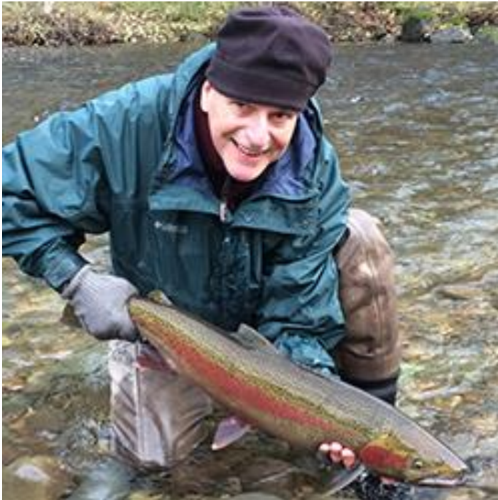
Clark-Skamania Fly Fishers President