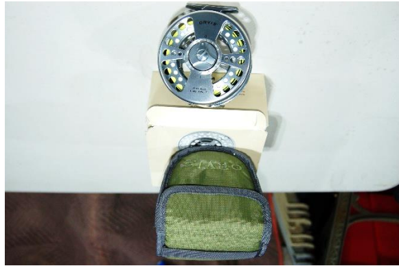
Orvis Battenkill Large Arbor V Fly Reel with line $250.00