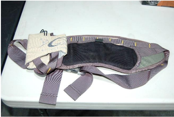
Back Brace $35.00