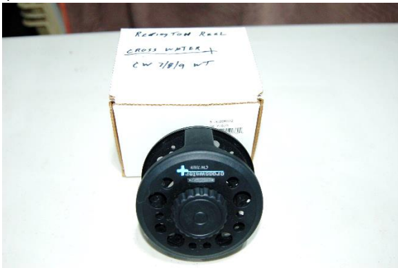
Redington Crosswater + CW 7/8/9 Fly Reel $50.00